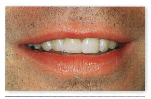
Figure 10: Case complete, clinical smile.

Milford, DE) polishing system and cemented using Tempbond NE<sup>™</sup> (Kerr; Orange, CA) temporary cement (Fig 6).