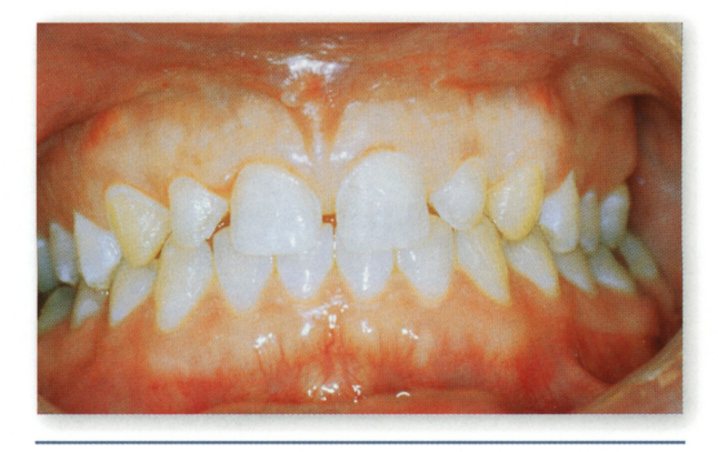
Figure 4: Prepared maxillary anterior teeth.

Prior to beginning restorative treatment on the patient, the student made casts from alginate impressions taken during the initial exam and mounted