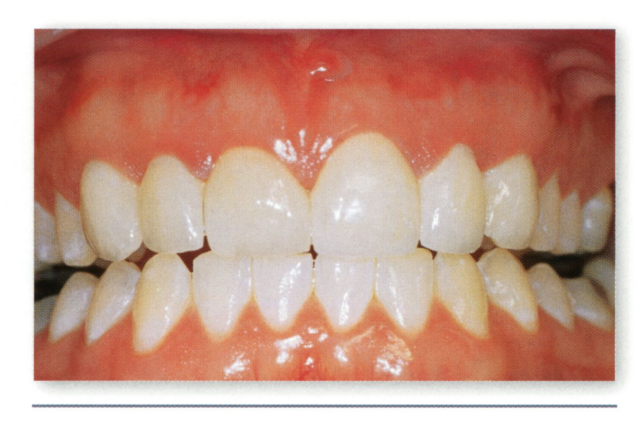
Figure 8: Case complete, 3 days after delivery.

finish lines were created even with the gingiva. The supervising instructor demonstrated the technique on one central incisor, and the student finished the preparations on the remaining teeth. The amount of reduction on each individual tooth was adjusted to correct for misalignment and to ensure an even contour across the anterior teeth mesiodistally (Figs 4 & 5). All preparations were kept in enamel, including the right lateral incisor, which required the greatest reduction to compensate for its rotation. The preparations were finished and defined using a fluted finishing bur. Immediately following the preparations, Ultrapak<sup>™</sup> (Ultradent; South Jordan, UT) gingival retraction cord