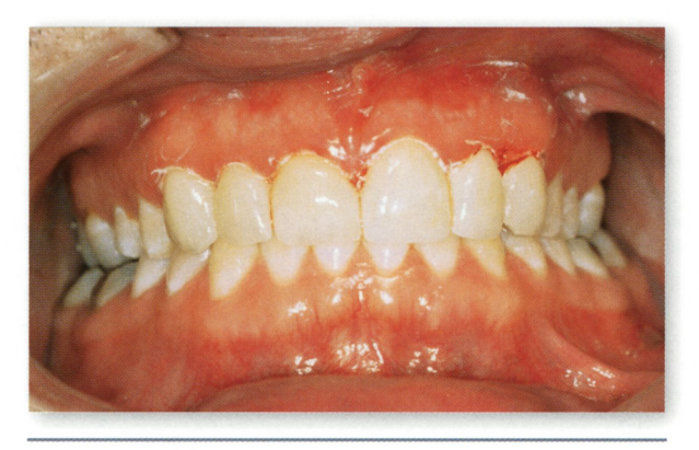
Figure 7: Veneers immediately after delivery.