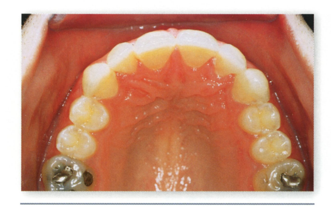
Figure 9: Case complete, occlusal view.