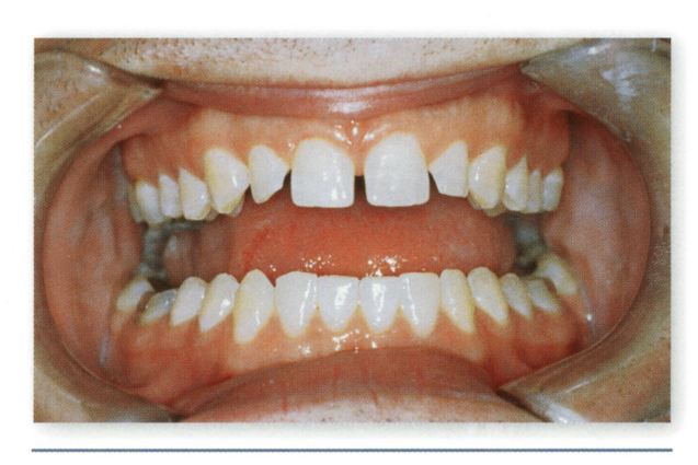
Figure 1: Pretreatment clinical appearance.