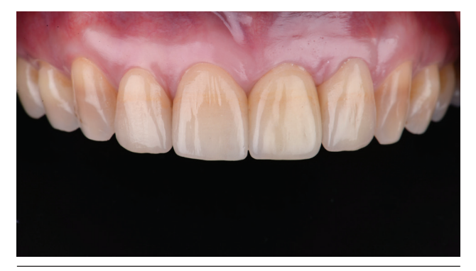
Figure 16: Postoperative frontal intraoral view; harmony of restorations and natural teeth was achieved by following the smile design blueprint.