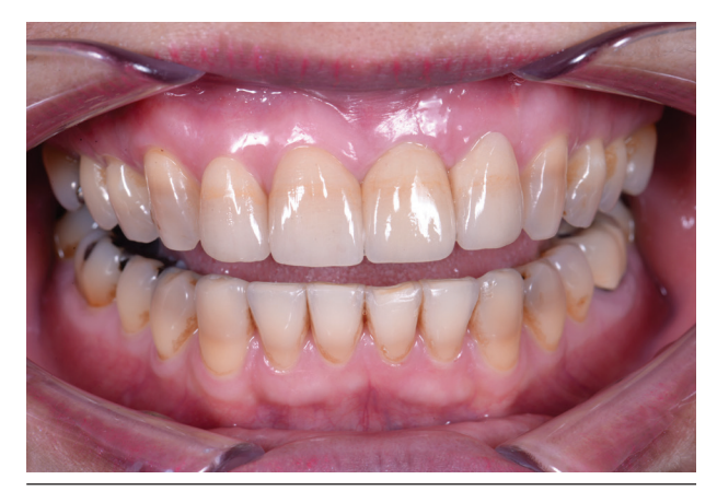
Figure 5: Note contralateral tooth size.

The examiners passed this case unanimously, with only minor deductions noted as follows: