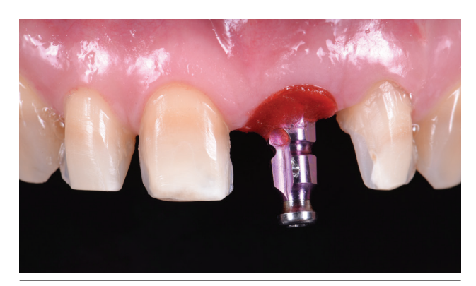
Figure 12: A customized impression coping was duplicated from the provisional restoration.

Both the restorative dentist and the surgeon evaluated the patient regularly during a sixmonth healing period.