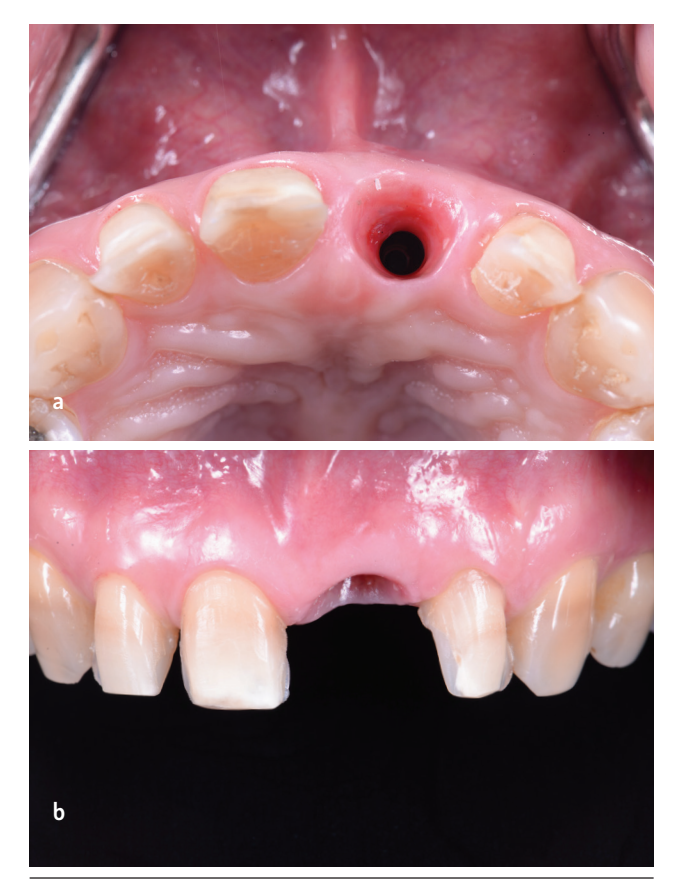
Figures 11a & 11b: Tissue was developed from the provisional restoration.