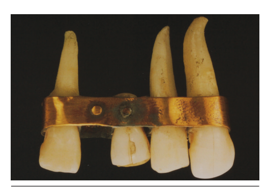
Figure 2: Tooth riveted with gold strap.