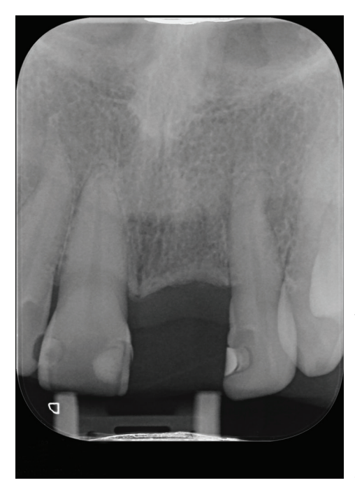
Figure 5: Preoperative periapical radiograph; medium bone resorption at edentulous area and faulty restorations.