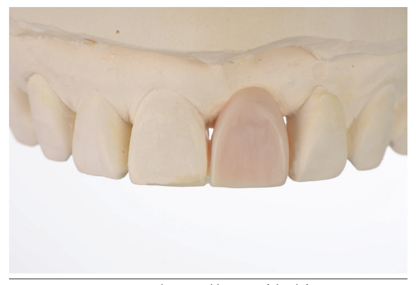
Figure 6: Diagnostic wax-up; this was a blueprint of the definitive restoration and also a good communication tool between team members and the patient.

A narrow platform implant (3.5 mm x 11 mm NobelActive, Nobel Biocare; Yorba Linda, CA) was placed 4 mm below the predetermined gingival margin to facilitate adequate postoperative prosthetic emergence. It was placed to engage the cortical bone with the position angled toward the incisal edge and torqued to 50 Ncm (Fig 7). A small cover screw was then placed. The labial bone around the dental implant was augmented with an allograft filler particle (BioOss, Zimmer Dental; Carlsbad, CA) mixed with the patient's blood. A deepithelialized connective tissue graft harvested from the maxillary palate was added to cover the filler particles and increase tissue availability. The surgical site was closed with 4-0 and 5-0 Vicryl sutures (Ethicon; Blue Ash, OH).<sup>2,3</sup> The patient was fitted with a temporary partial denture, which was adjusted so that no pressure would be exerted on the implant site.