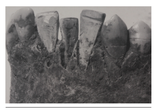
Figure 3: First dental implants.