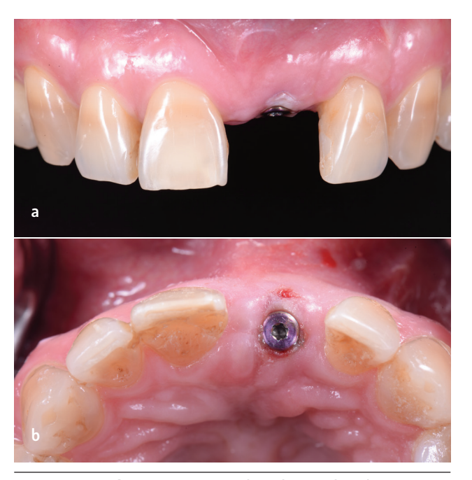
Figures 8a & 8b: Osseointegrated implant with soft tissue healing.

After the ideal tissue contours had been developed and matured by modifying the provisional (Figs 11a & 11b) and #7, #8, and #10 were prepared for veneer restorations, a final impression was taken. A fixture level impression with a custom impression coping was made using a polyvinyl siloxane impression material (Extrude, Kerr; Orange, CA).6 To create the custom implant coping, the provisional crown was removed and then connected to a fixture replica and impressed into a plastic cylinder filled with putty. The provisional crown was then unscrewed, an impression coping was connected to the replica, and the space was filled with acrylic (Pattern Resin, GC America; Alsip, IL (Fig 12). The obtained custom coping was marked on the labial surface to aid orientation and unscrewed from the putty cylinder. It was then connected to the implant fixture and used in an open-tray technique for the final impression.7 This method replicates the accurate soft tissue contour onto the working cast and provides the laboratory technician with detailed information to duplicate the established emergence profile.<sup>8,9</sup> Multiple shade photographs were taken to communicate with the technician. A custom zirconia abutment (NobelProcera, Nobel Biocare) was fabricated and torqued to 35 Ncm (Figs 13a-14). The ceramics were e.max Press (Ivoclar Vivadent) with a cut-back and layering technique; the ingot was LT A2 layered with A2, E14, TI1, and T Neutral (Ivoclar Vivadent).