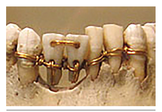
Figure 1: Gold wire bridge, 500 BC.