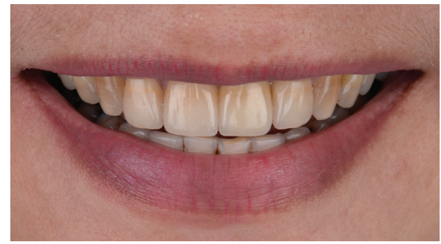
Figure 17: A natural, harmonious smile that follows the patient's upper and lower lips.