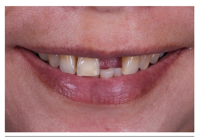
Figure 2: Preoperative close-up view; medium smile line.