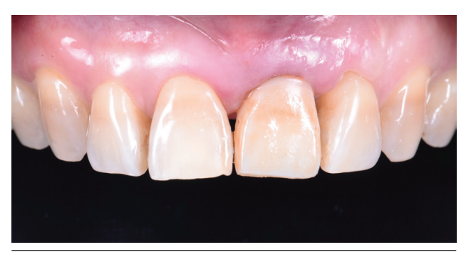
Figure 9: Implant-supported provisional crown for soft tissue development.