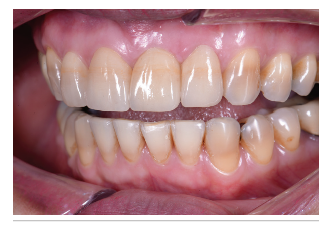
Figure 4: Slightly long contacts due to papilla height.