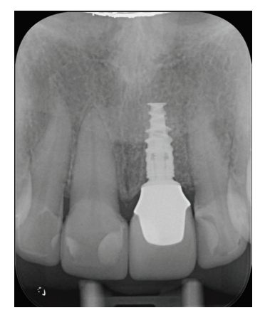
Figure 15: Postoperative periapical radiograph; crestal bone stability around the implant and complete integration of restorations and abutments.