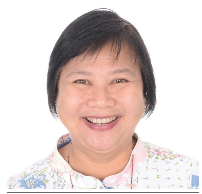
Figure 18: Postoperative full-face smile view. The patient's smile looks very natural and in harmony with her face.