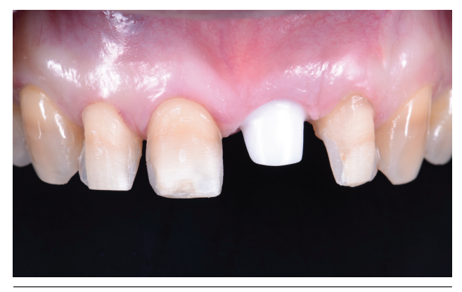
Figure 14: Preparations #7, #8, and #10, and CAD/CAM zirconia abutment hybrid with titanium base.