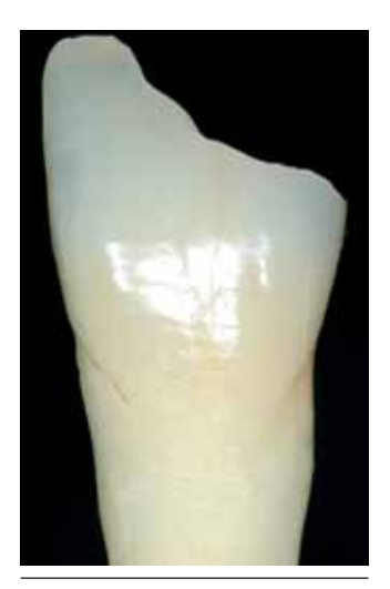
Figure 2: It is necessary to understand the components of the optical properties of the adjacent tooth structure.

A CLASS IV FRACTURE REQUIRES an understanding of the components of the optical properties of the adjacent tooth structure to create an invisible restoration (Fig 2). A series of two bevels is helpful in visually blending the cavo-surface into the surrounding tooth structure. The primary bevel involves the first 2 mm of the preparation. The secondary bevel continues from this point and tapers into the tooth's final facial contours (Fig 3).