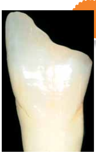
Figure 3: It is helpful to have two bevels to visually blend the cavo-surface into the surrounding tooth structure.