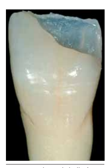
Figure 4: A lingual shell of semi-translucent enamel shade composite defines the outline of the final tooth.