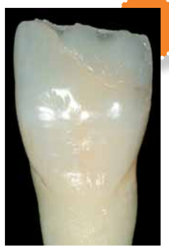
Figure 5: A dentin shade is sculpted.

A LINGUAL SHELL OF SEMI-TRANSLUCENT ENAMEL shade composite defines the outline of the restored tooth. This is best developed utilizing a lingual putty stent created preoperatively from a diagnostic wax-up, or a composite mock-up intraorally (Fig 4). A dentin shade (which typically has the highest opacity in most resin systems) is then sculpted to reproduce the natural contours of the dentinal lobes observed in the adjacent tooth structure or adjacent teeth (Fig 5).