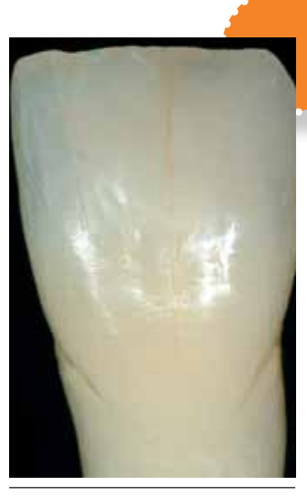
Figure 8: It is important to replicate the surface texture and polish that exist in the natural tooth surface.

The achievement of Accreditation requires a level of excellence that demonstrates a broad knowledge and skill set in the restoration of teeth to their natural state. The mastery of stratification is a key principle in the successful restoration of teeth with both resin and ceramic materials.