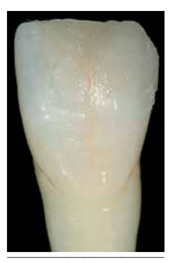
Figure 7: A final layer of enamel resin is applied.