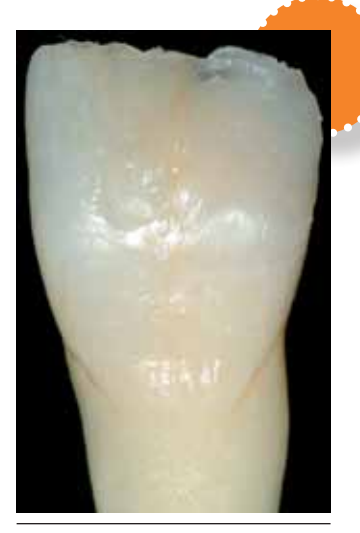
Figure 6: A chromatic or body shade resin is helpful in eliminating any visual recognition of the cavosurface.

A LINGUAL SHELL OF SEMI-TRANSLUCENT ENAMEL shade composite defines the outline of the restored tooth. This is best developed utilizing a lingual putty stent created preoperatively from a diagnostic wax-up, or a composite mock-up intraorally (Fig 4). A dentin shade (which typically has the highest opacity in most resin systems) is then sculpted to reproduce the natural contours of the dentinal lobes observed in the adjacent tooth structure or adjacent teeth (Fig 5).